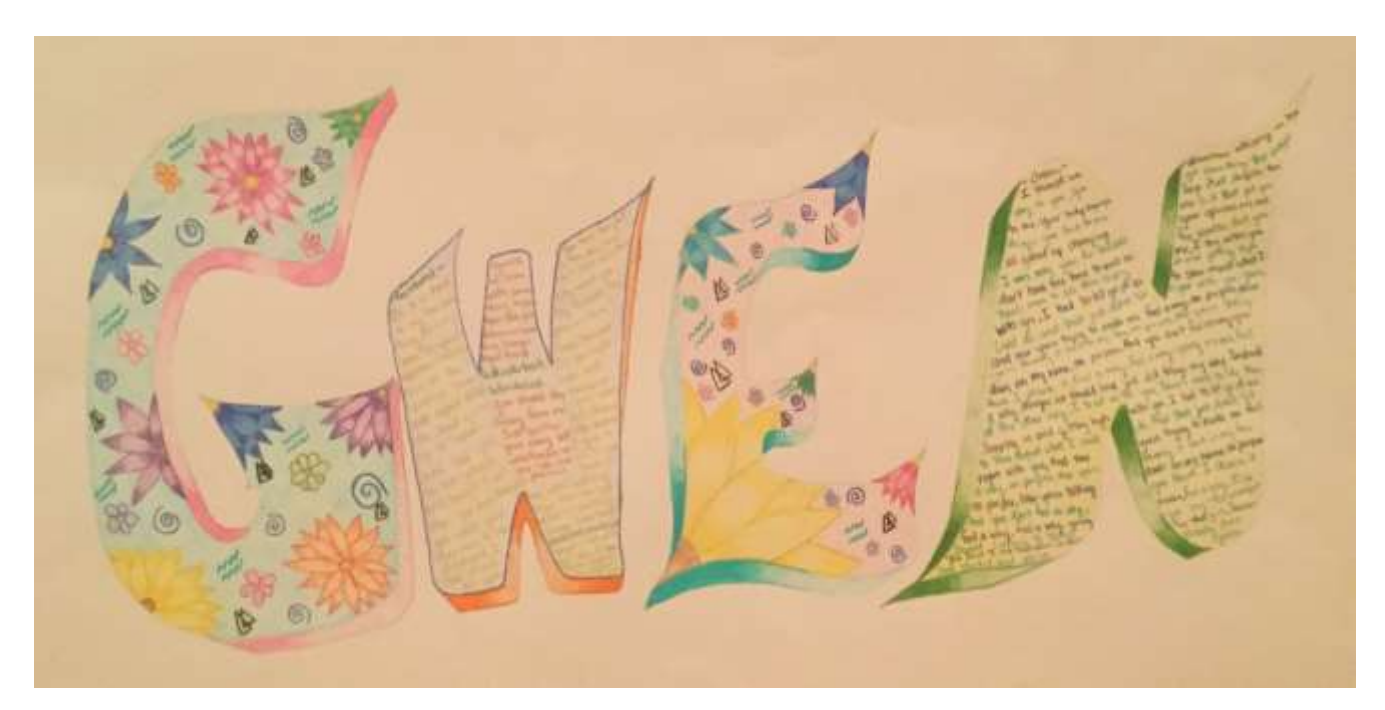
Gwen Goracke 1 pt Perspective Name