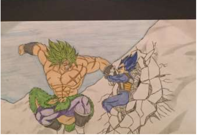
Steven Plager Two Warriors