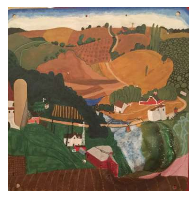
Savana Mallard Grant Wood Portrait in a Landscape 16