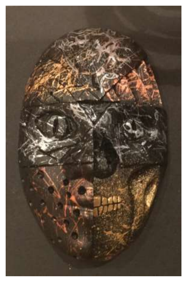
Autumn Nolte Metallic Mask