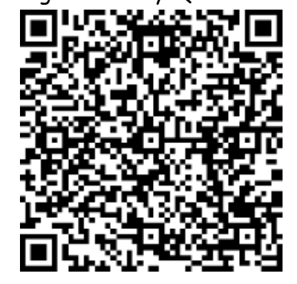
English Survey QR Code