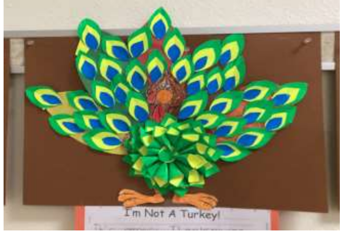
Please check these (not) turkeys out on the jccentral.org website to see the beautiful (not) turkeys in color. District/Monthly Newsletters